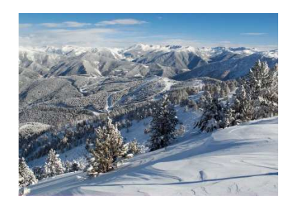
Pyrénées - à 1h de Perpignan