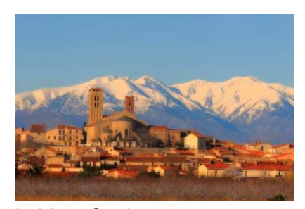
le Mont Canigou