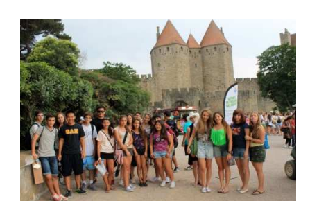
Carcassonne - à 1h